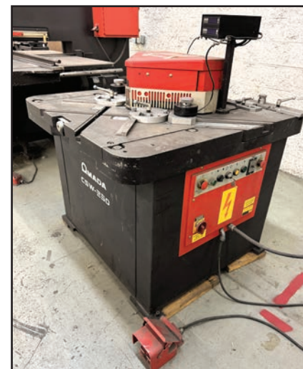
AMADA CSW-250 CORNER NOTCHER