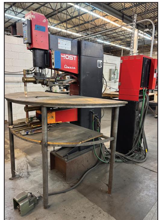
AMADA ID-40-ST SPOT WELDER