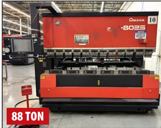
AMADA FBD-8025NT CNC PRESS BRAKE