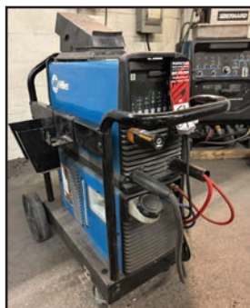
MILLER DYNASTY 280 TIG WELDER