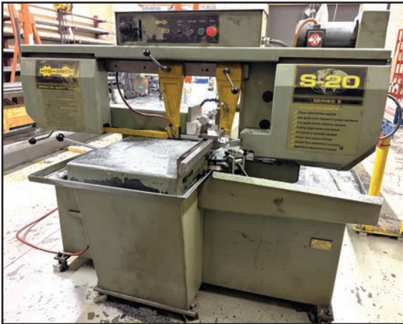
HYD-MECH S-20 HORIZONTAL BANDSAW