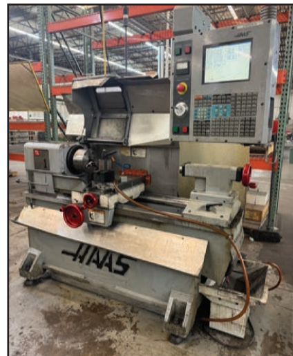
2005 HAAS TL-1 CNC LATHE