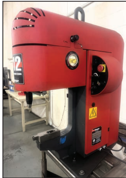
HAEGER 412-110 INSERTION MACHINE