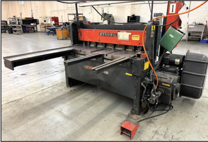
WYSONG 1252 SHEAR