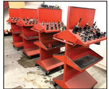
VIEW OF TOOL HOLDERS & CARTS