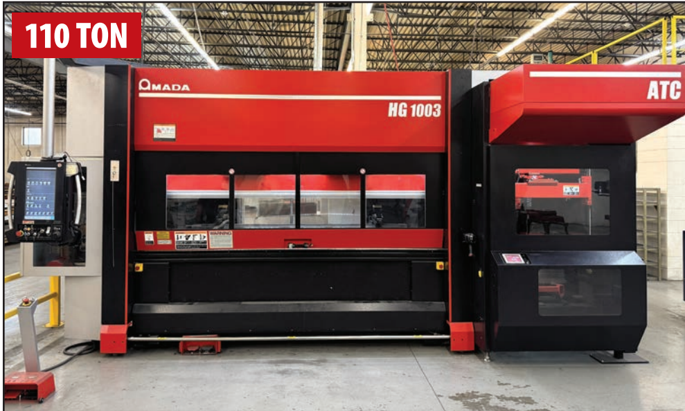
2017 AMADA HG-1003 ATC CNC PRESS BRAKE

PRE-AUCTION OFFERS INVITED ON MAJOR ASSETS