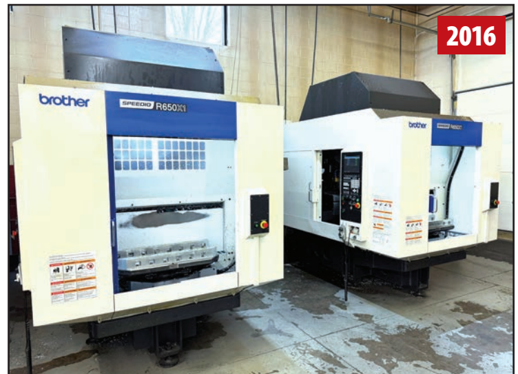
(2) BROTHER SPEEDIO R650X1 DRILLING & TAPPING CENTERS

Featuring: 2017 AMADA HG-1003ATC CNC Press Brake; (4) AMADA RG & FBD CNC Brakes – up to 110 Ton; AMADA VIPROS 358 KING II & VIPROS 357 Turret Punches w/ Material Handling; AMADA LC1212A3 Laser; (3) PEMSERTER & HAEGER Insertion Presses; (2) 2016 BROTHER SPEEDIO R650X1 VMC's; (4) HAAS VF-4BAPC, VF-4B, VF-2B & VF-1D - New as 2007; (2) HAAS TL-1 CNC Lathes; Machine Tools; Metal Fabrication; MIG, TIG & Spot Welders; Forklifts; Support Equipment; 2011 FREIGHTLINER SPRINTER 2500 Van; & More