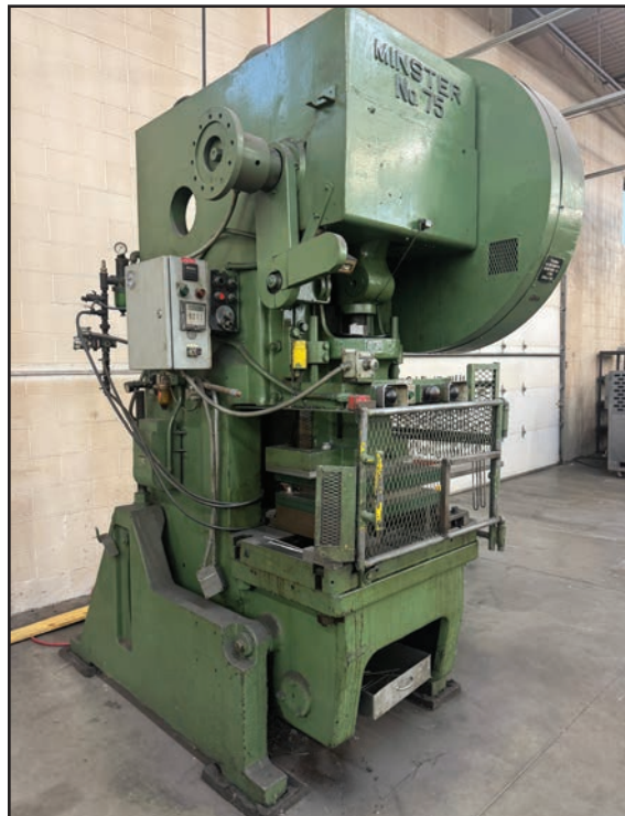
MINSTER NO. 75 OBI PRESS