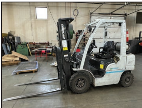
UNICARRIER MP1F2A25LV LP FORKLIFT

CLARK CP-7 WALKIE-STACKER , s/n CP-0086-6814, 1,500 Lb. Capacity