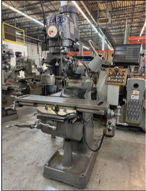
SHARP 3 HP MILLING MACHINE

(2) CLAUSING 1666 DUAL HEAD GANG DRILLS , s/n 15-536465, 15-565464, w/ 53" x 24-3/4" Table, 330-4000 RPM, 7.5" Throat