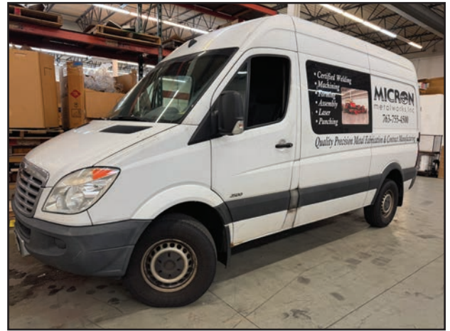
2011 FREIGHTLINER SPRINTER 2500 CARGO VAN

ALSO: Press Brake Tooling, Over (300) BT40 and BT30 Tool Holders, Over (40) KURT Machine Vises, Tooling Carts, Work Benches, Racking, Pallet Jacks, Self Dumping Hoppers, VESTIL and MECO Scissor Pallet Stands, Large Selection of Round Stock, Square Stock, Aluminum and Scrap, Cantilever Racks, Shop Carts, Hand Tools, Power Tools and More