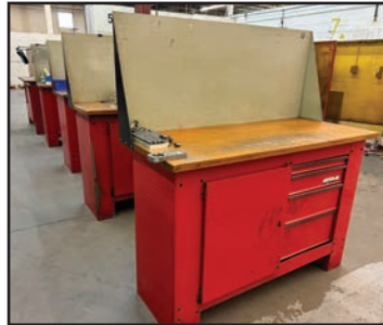
VIEW OF WATERLOO WORK BENCHES