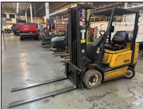
YALE GLC050 LP FORKLIFT