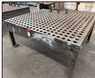
ACORN PLATEN WELDING TABLE