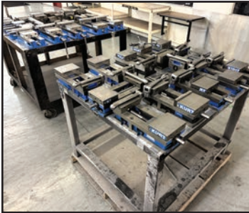
VIEW OF KURT VISES