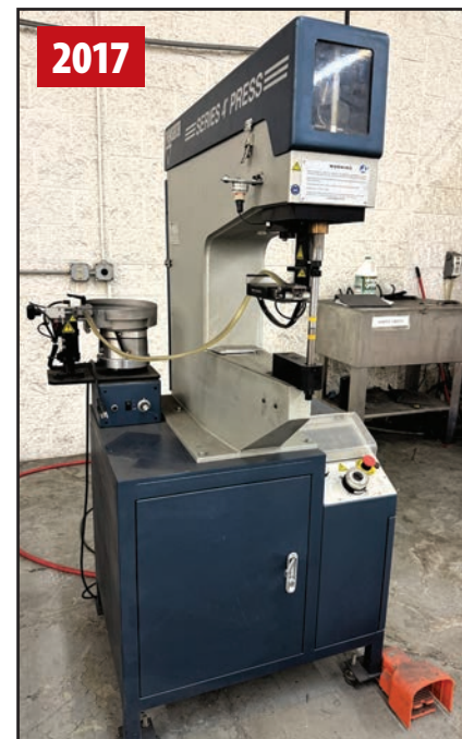
PEMSERTER 4AF-110 INSERTION MACHINE