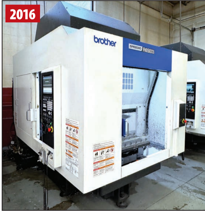
1 OF 2 BROTHER SPEEDIO R650X1 DRILLING & TAPPING CENTER