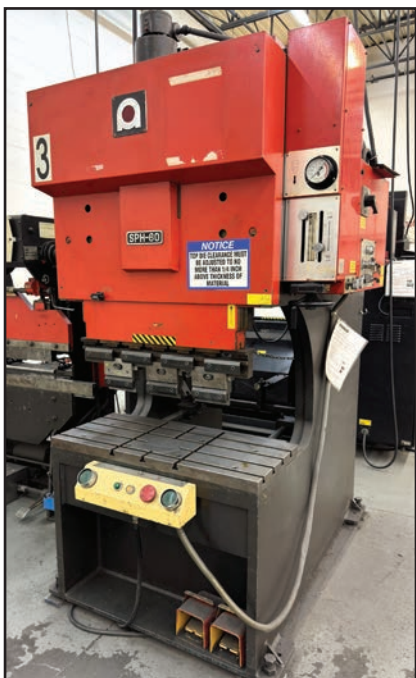
AMADA SPH-60 BRAKE/PUNCH