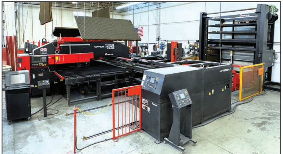
AMADA VIPROS 358 KING II TURRET PUNCH CELL

2016 AMADA TOGU III HIGH PRECISION AUTOMATED TOOL GRINDER , s/n 30231412