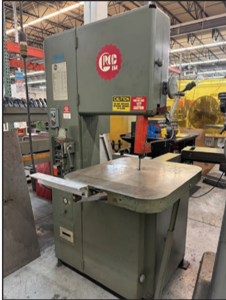
GROB 4V-18 VERTICAL BANDSAW