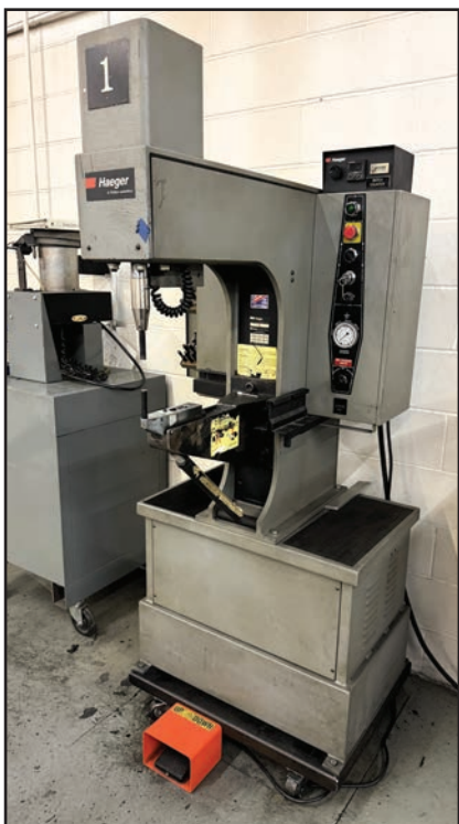
HAEGER HP6-C-1 INSERTION MACHINE

PAT MOONEY PMI 20 MITER UPCUT SAW , s/n 1020315004