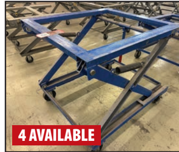
VESTIL PS-4045/CK 4000 LB. SCISSOR PALLET STAND