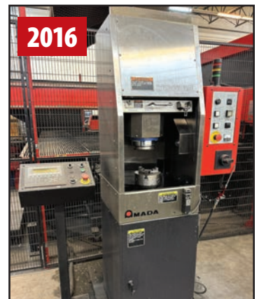
AMADA TOGU III TOOL GRINDER