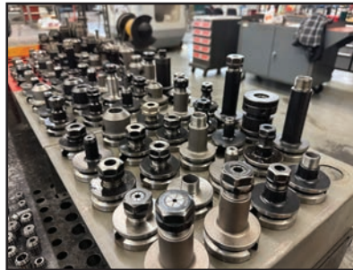
VIEW OF TOOL HOLDERS