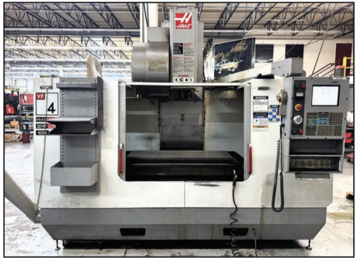
2003 HAAS VF-4B VMC