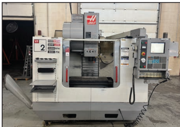
2005 HAAS VF-2B VMC