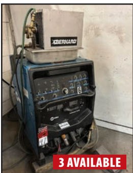
MILLER SYNCROWAVE 250 DX TIG WELDER

ALSO: ACORN Platen Welding Tables, Assorted Welding Rod, Welding Curtains, TRION Air Boss M2500 Media Air Cleaner, s/n M2500V-01-00008, AIR PURIFICATION SYSTEMS 2800 Media Air Cleaner, s/n 795442, Steel Welding Tables, and Torch Cart