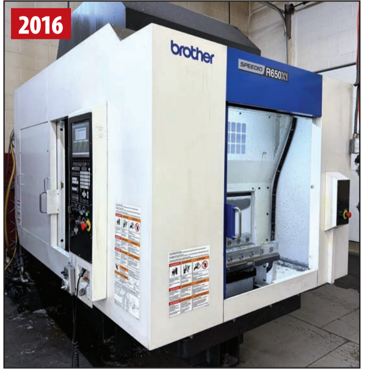
2 OF 2 BROTHER SPEEDIO R650X1 DRILLING & TAPPING CENTER