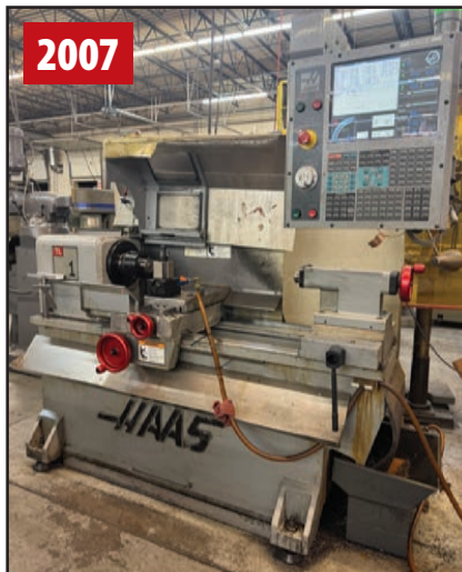
HAAS TL-1 CNC LATHE

MINSTER NO. 75 OBI PRESS , s/n 75-12444, 75 Ton Capacity, 4" Stroke, 4" Adj, 9-1/2" to 13-1/2" Shut Height, 23-1/2" x 35" Bed, 10-1/2" x 23" Ram, w/ LITTELL No. 412-7PDL Straightener, s/n 76157-67, .093" x 12"W Capacity, LITTELL No. 3 Automatic Centering Reel, s/n S-9135-77, 300 Lb Capacity, 10-20" Inside Diameter, 6-1/2" Max Width, (Straightener and Reel to be Sold Separately)