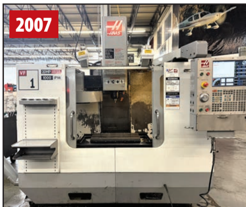
HAAS VF-1D VMC

PRE-AUCTION OFFERS INVITED ON MAJOR ASSETS