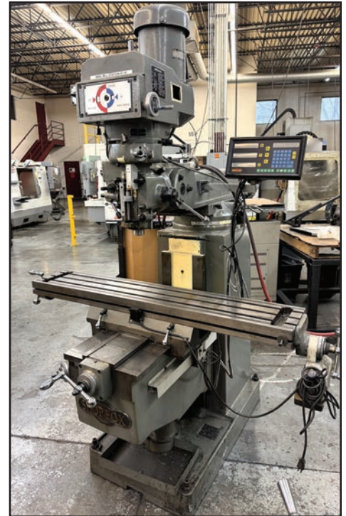
SHOP FOX X06325H MILLING MACHINE