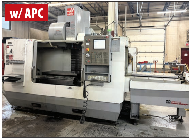
2006 HAAS VF-4BAPC VMC