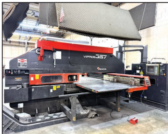
AMADA VIPROS 357 TURRET PUNCH PRESS