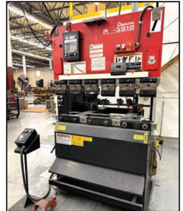
AMADA RG-3512LD CNC PRESS BRAKE