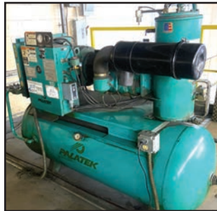
PALATEK 15 DR 15 HP AIR COMPRESSOR