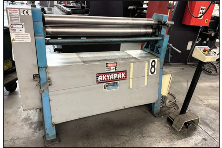
AKYPAK 1050X80X2 3-ROLL BENDING ROLL