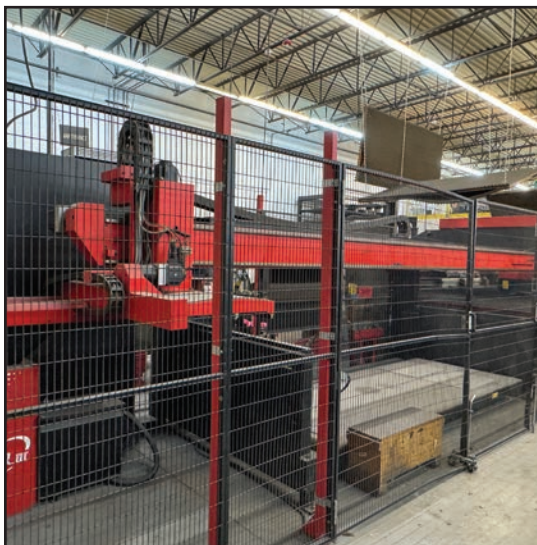
AMADA VIPROS 358 KING II TURRET PUNCH - UNLOAD SYSTEM