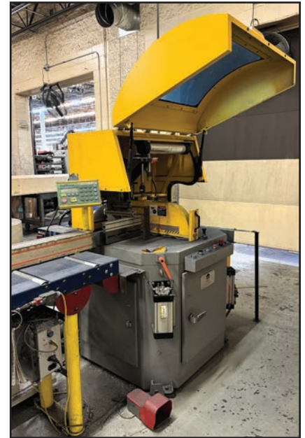
PAT MOONEY PMI 20 MITER UPCUT SAW