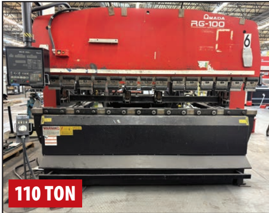
AMADA RG-100 CNC PRESS BRAKE

AMADA RG-3512LD CNC PRESS BRAKE , s/n 35120059, w/ AMADA LD Control, 38 Ton, 49" Bend Length, 40" Between Uprights, 7.9" Throat, 3.94" Stroke