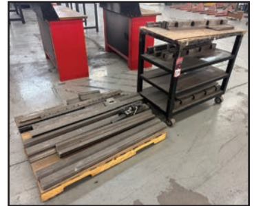
PRESS BRAKE TOOLING

For auction inquiries, please contact Jennifer Reiner at (847) 545-6374 or jennifer@perfectionindustrial.com