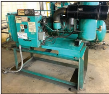
PALATEK 20 DP 20 HP AIR COMPRESSOR